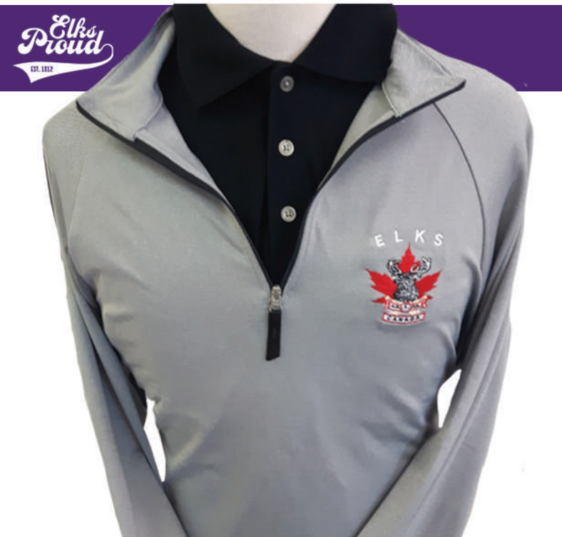
Devon & Jones 1/4 zip pullover $49.95