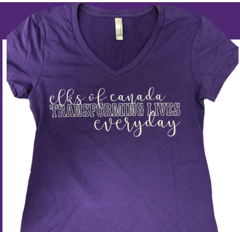
Women's V-Neck T-Shirt $15.99