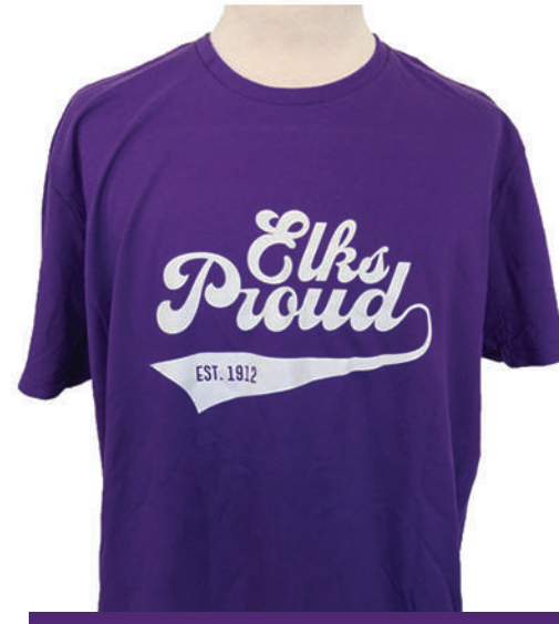
ELKS PROUD T-SHIRT $15.99