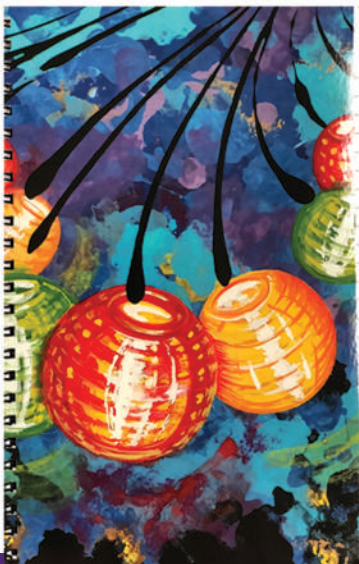
PATIO LANTERN NOTEBOOK $12.50