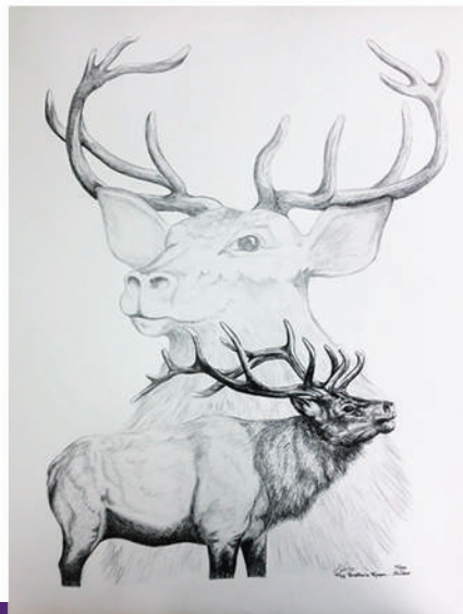
MY BROTHERS KEEPER LIMITED PRINT $4.99